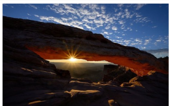
Moab