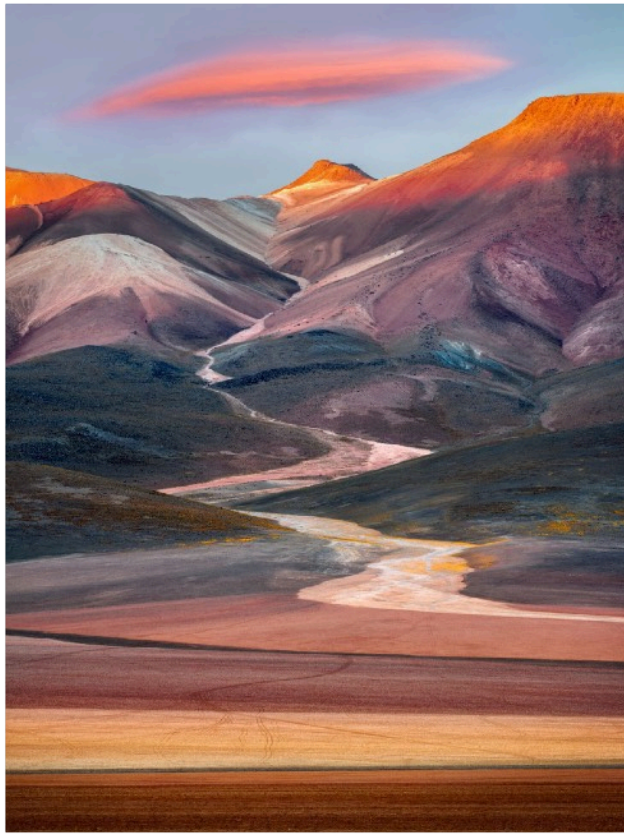
“Seven Colours Mountain” by Ignacio Palacios